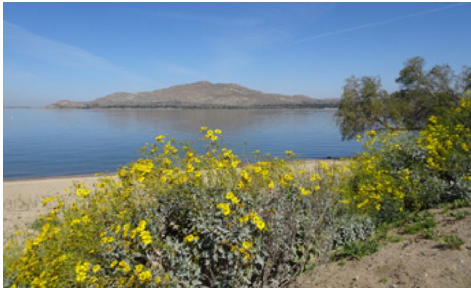
Lake Perris State Recreation Area

by the Planning Commission and then approved by the City Council on February 2, 2021. The MVBP is not a business park but a single 220,390 sq.ft. warehouse on approximately 10 acres at the southeast corner of Heacock Street and Ironwood Avenue. In 2018 the Moreno Valley Festival Specific Plan was amended to allow alternative uses upon the undeveloped acreage behind the exiting Festival Shopping Center. This amendment added and designated Business Park uses for the undeveloped land but did not include the 10-acre MVBP site. When the 2018 amendment processed through its approval process, the titled "Business Park" designation misled the surrounding property owners and others who thought