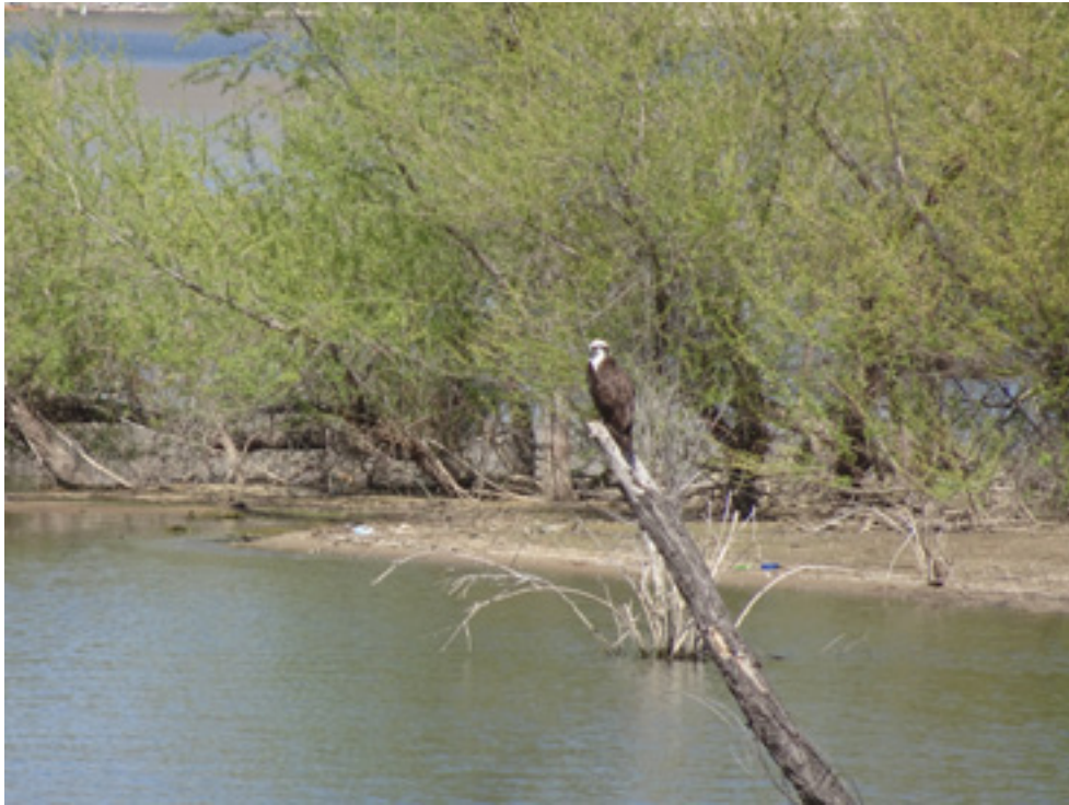
Lake Perris State Recreation Area, Osprey

2021, meeting. The draft environmental impact report (DEIR) comment period ended on May 17 and the final programmatic Environmental Impact Report (F-PEIR) was released a few days later and scheduled for consideration by the Planning